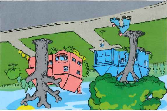
Topping is perhaps the most harmful tree pruning practice known. Yet, despite more than 25 years of literature and seminars explaining its harmful effects, topping remains a common practice.