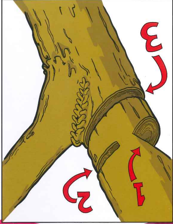
Alternatives to Topping

www.isa-arbor.com • www.treesaregood.org