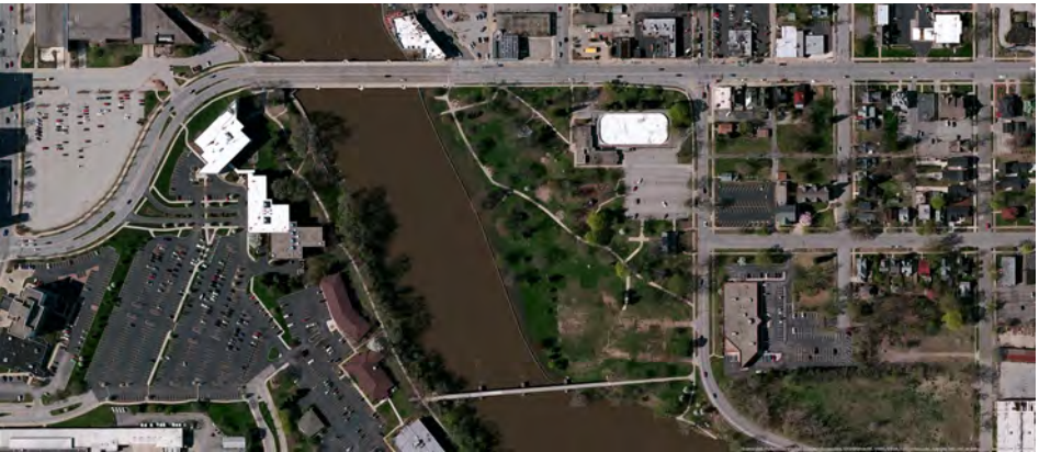
Howard Park Aerial View

The vision for Howard Park includes a new combined ice and water feature, play areas, new buildings, an event lawn, and a stormwater/habitat feature. The recommendations for Howard Park strive to offer multiple spaces for various sized events, and to be a prominent destination for residents and visitors. The Howard Park recommendations include: