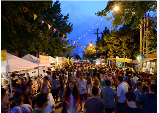
Seattle Street Food Festival, Seattle, Washington