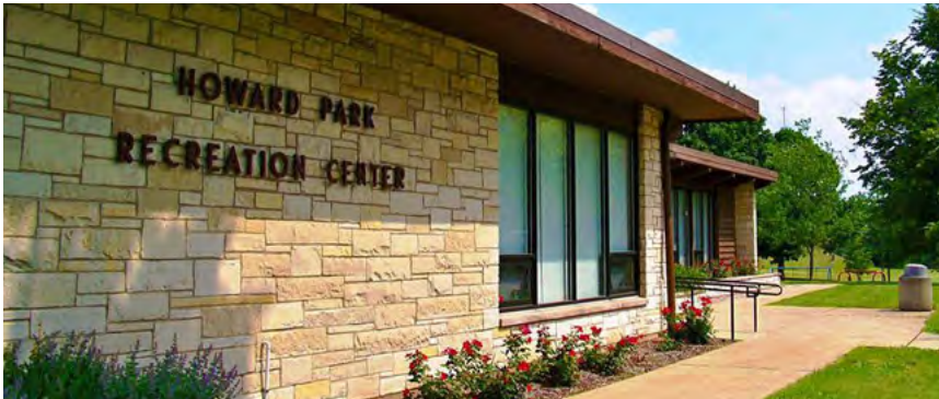
Howard Park Existing Conditions