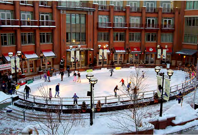
Huntington Station ice Rink, Long Island, New York

This series of precedent images served as inspiration for how the interactive water feature might look and operate within a landscape similar to that of Howard Park.