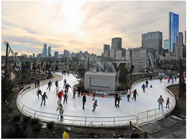
Maggie Daly Park, Chicago Illinois