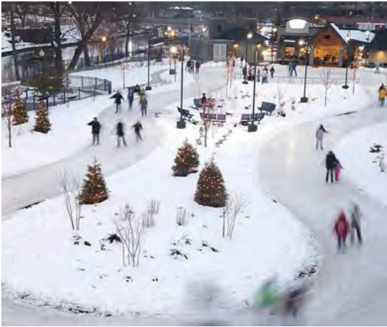
Elkhart Skating Ribbon, Elkhart Indiana

These series of precedent images informed the proposed ice skating facility at Howard Park.