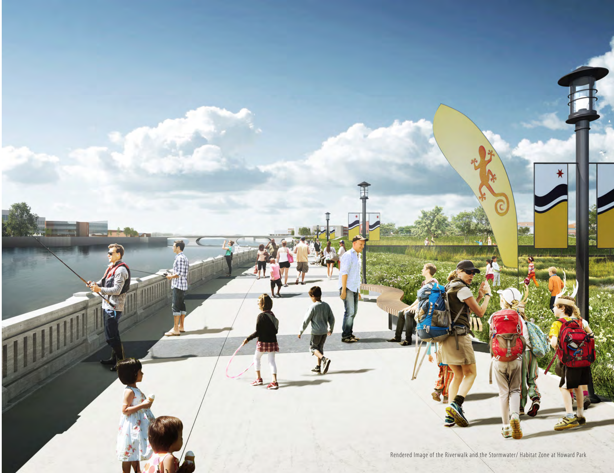
Rendered Image of the Riverwalk and the Stormwater/ Habitat Zone at Howard Park

This series of precedent images served as inspiration for the habitat creation and overlooks proposed for Howard Park.