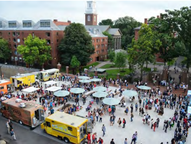
Chandler Non Profit Food Truck Benefit, Phoenix, Arizona

This illustrative section shows the proposed festival street at St. Louis Street. The festival street is envisioned to host a series of organized events, including food fairs, art tours, artisan booths, food truck events, and local music and creative events. During times of inactivity, St. Louis offers shady on-street parking for park users and adjacent residents.