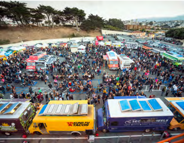
NoHo Food Truck Collective, Hollywood, California

This series of precedent images were used as inspiration for the proposed festival street at St. Louis Street.