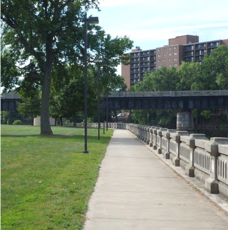
Howard Park Existing Conditions

13. Riverwalk – A new 20-foot wide Riverwalk is proposed to accommodate a variety of users and even to provide space for small vendors or exhibitions. The existing balustrade is maintained and repaired where needed.