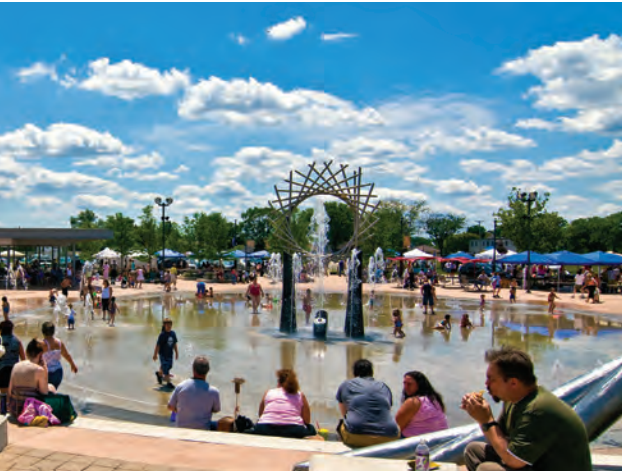
Warren City Center, Warren, Michigan

This illustrative perspective shows how the plaza space can be used in the winter season as an ice skating amenity. Rather than in the traditional rink configuration, the skating experience is intended in a more organic shape even allowing some areas to be separated for private events. The plaza offers many amenities, like a cafe, seating, a fire pit and a center platform for ornaments, sculptures or festive elements.