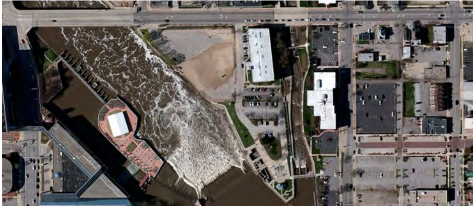
Seitz Park Existing Conditions

The recommendations envision Seitz Park as a vibrant, active center on the river that accommodates the existing and proposed programming and adjacent development. The vision for Seitz Park includes: