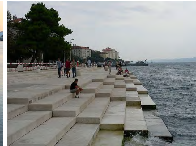
Sea Organ, Zadar Croatia