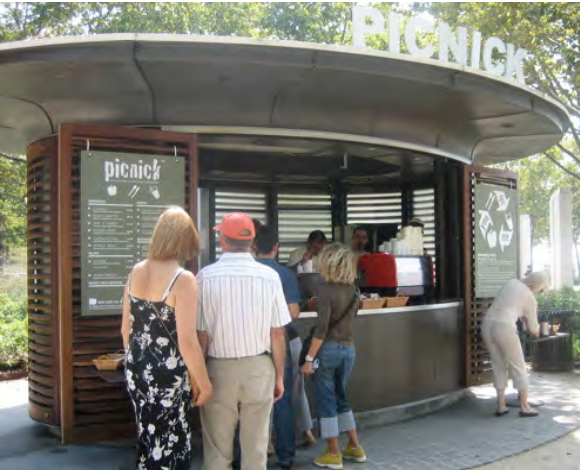
Bryan Park Kiosk, New York City

This illustrative section shows the new river edge at the East Race. A tiered and widened river edge provides a variety of spaces for users to over look the activity of the East Race. The adjacency to the Seitz Park Pavilion makes this area a central destination during all times of the year.