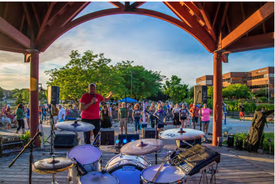
Seitz Park Existing Conditions & Events