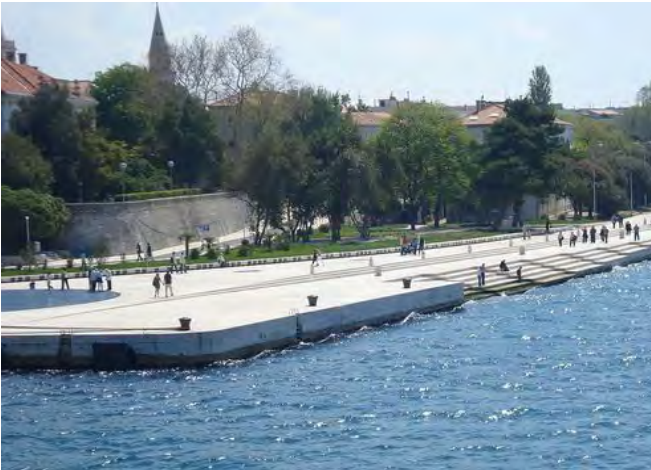
Sea Organ, Zadar Croatia