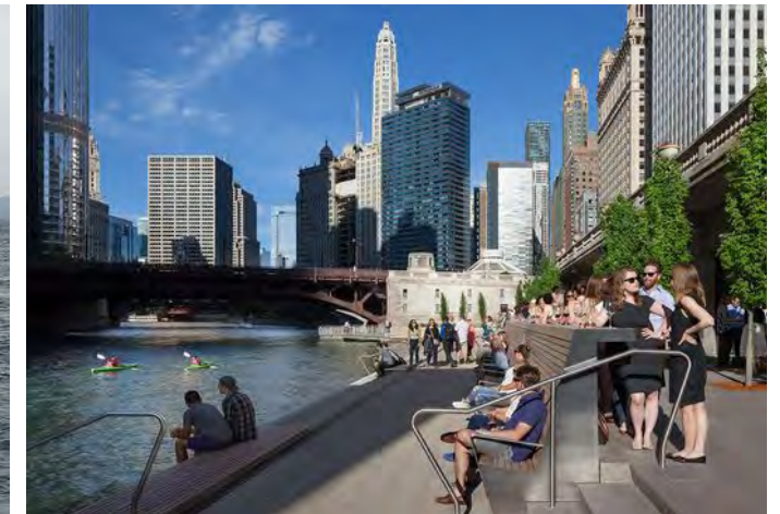
Chicago Riverwalk, Chicago Illinois

This series of precedent images served as inspiration for how the portage edge might look to help users gain access to the St. Joseph River.