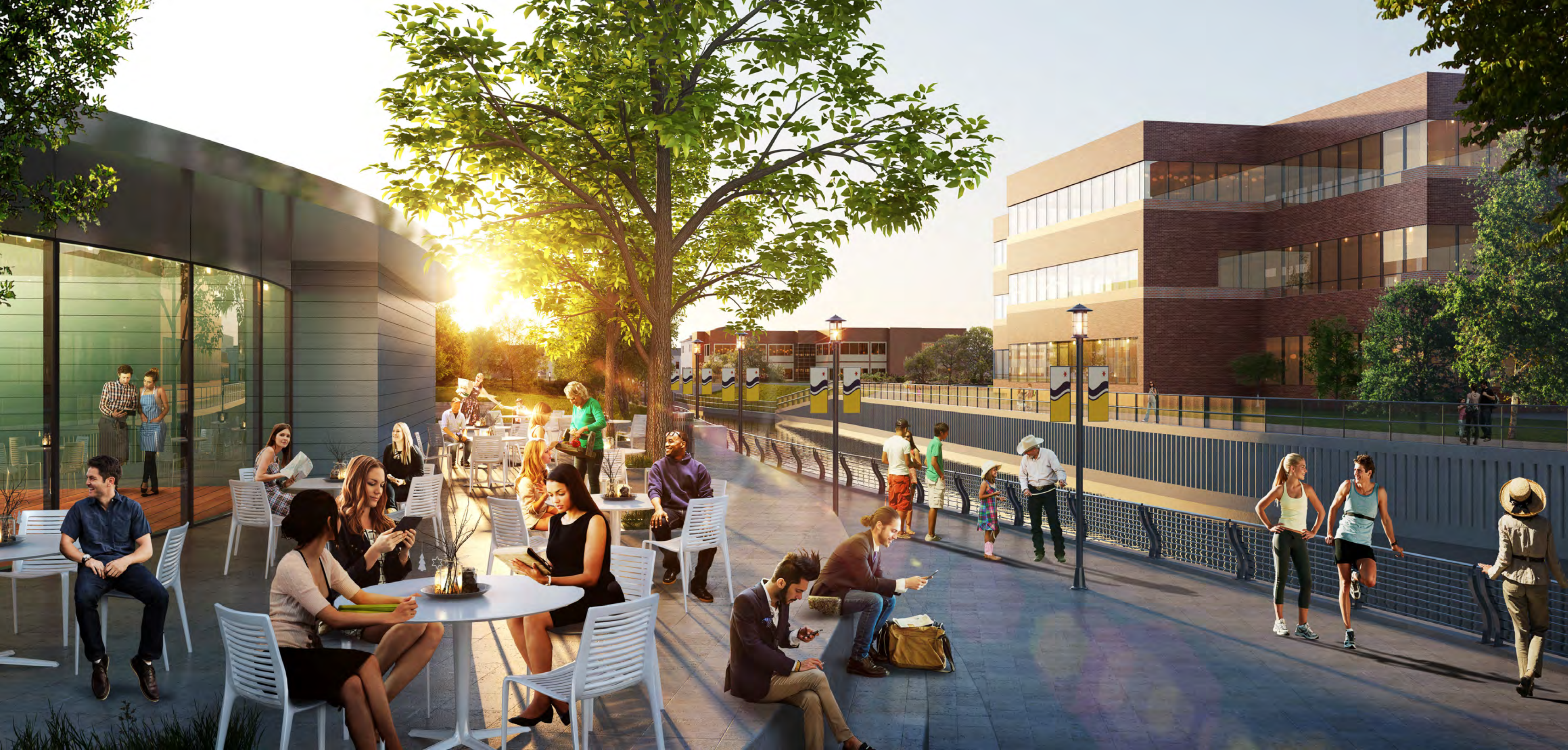
Rendered Image of the East Race at Seitz Park