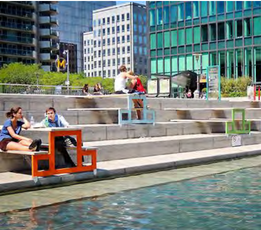
La Grand Cantine, Paris France

This series of precedent images served as inspiration for the proposed Seitz Park Pavilion.