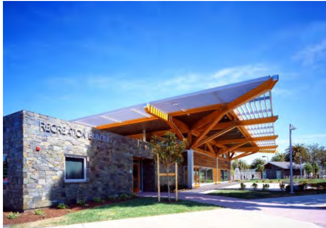
Orange Memorial Park, San Francisco California