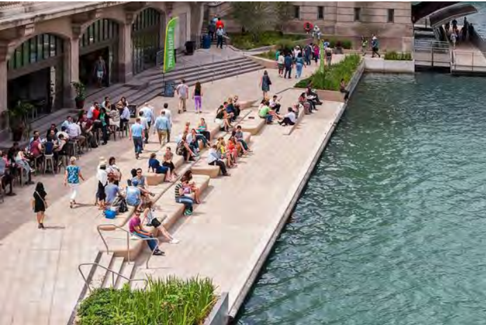
Chicago Riverwalk, Chicago Illinois