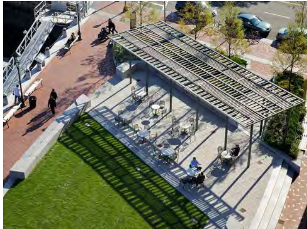
Atlantic Seaport, Boston Massachusetts